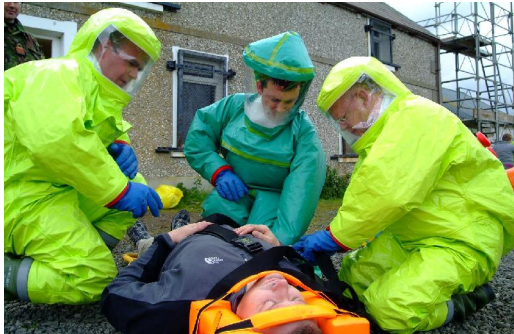
Cross border Emergency Planning Exercise in 2009