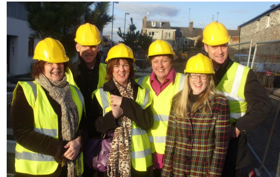
CAWT's Older Person's Project Board visiting an integrated living facility in Dundalk