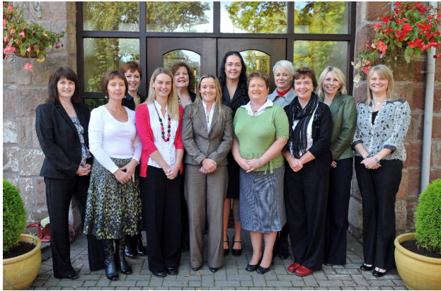
CAWT's 12 Project Managers for the EU INTERREG IVA projects