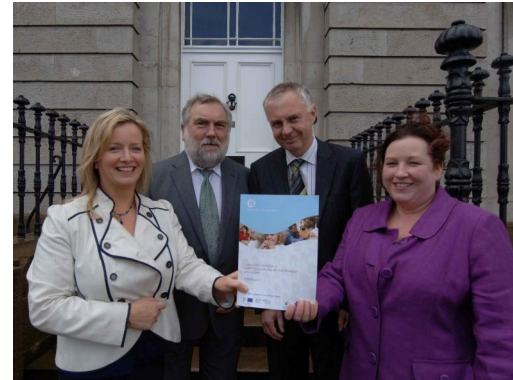
Launching the cross border GP Out of Hours Evaluation report